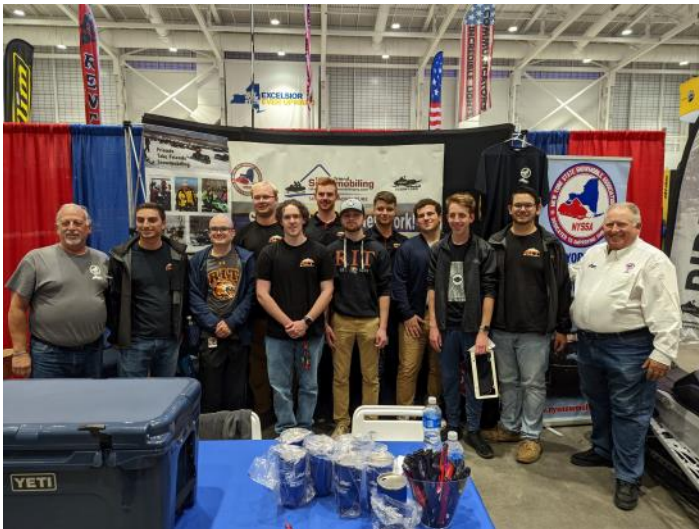
RIT Clean Snowmobile Team with NYSSA at The Big East Show

Please reach out to us by sending an email to cleansnow@rit.edu with any leads on obtaining a snowmobile meeting these requirements.