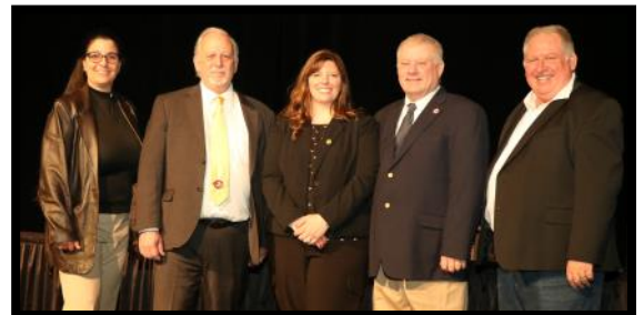
2022-2023 NYSSA Officers and Staff