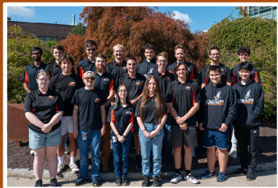
Team Photo 2023-2024