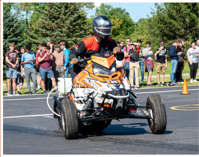
Performance Team New Member Day